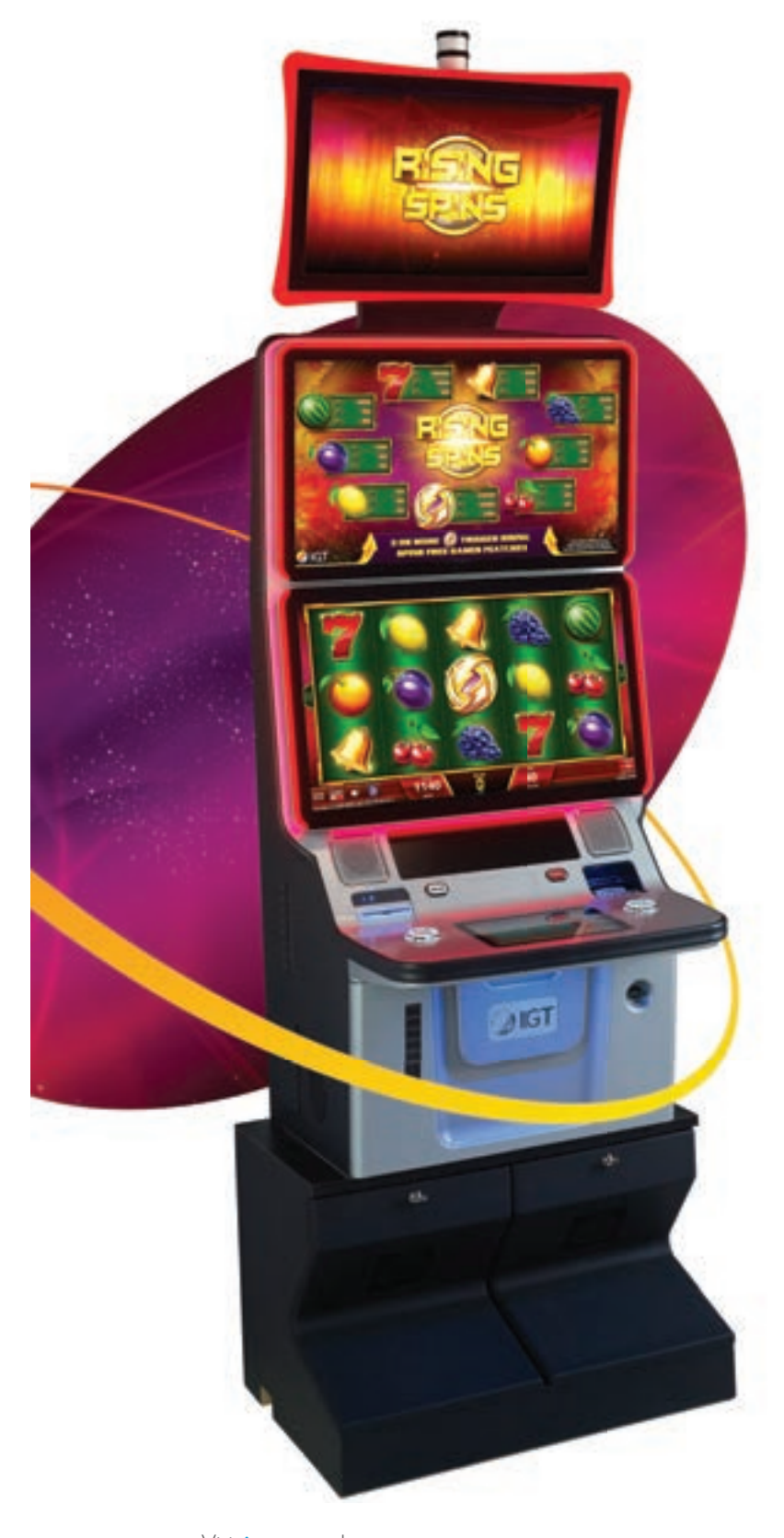
Visit igt.com to learn more