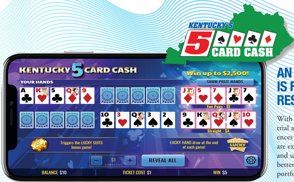
The Kentucky Lottery is extending its retail draw-game brand, 5 Card Cash, with a new IGT PlayInstantWin game.