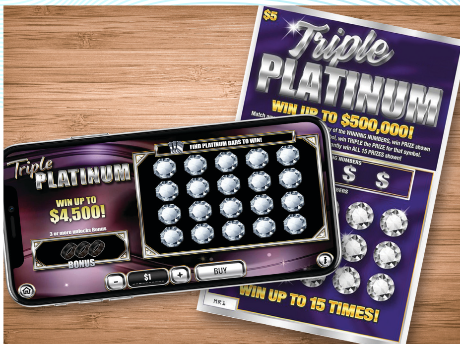
The scratch card Triple Platinum is an IGT example of a retail instant ticket derived from an elnstant game. The game will see a cross-channel launch in Rhode Island this year.

One of the largest benefits of digital lottery is the amount of data the channel provides, giving operators the ability to analyze game performance in extensive detail. IGT possesses substantial data sets, and we perform a rigorous data analytics process to analyze each global game launch. IGT analysts use both historical data and predictive analytics to understand how each of our games performs in any given jurisdiction, looking