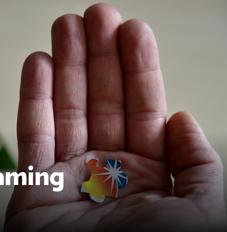
Photo : Claudio Canali Gaming Machines - Field Operations Rome, Italy

IGT's commitment to Responsible Gaming reflects our core values. It's woven into the fabric of our product development, programs, services, and policies.